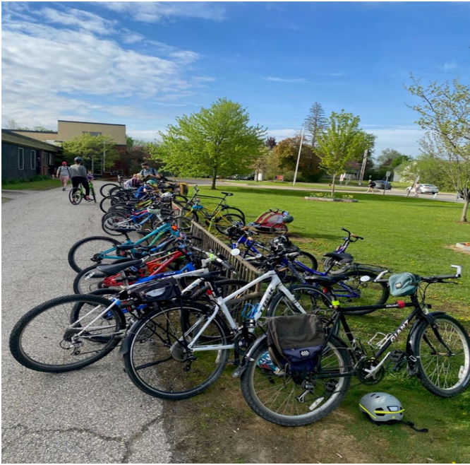
Middlebury elementary school