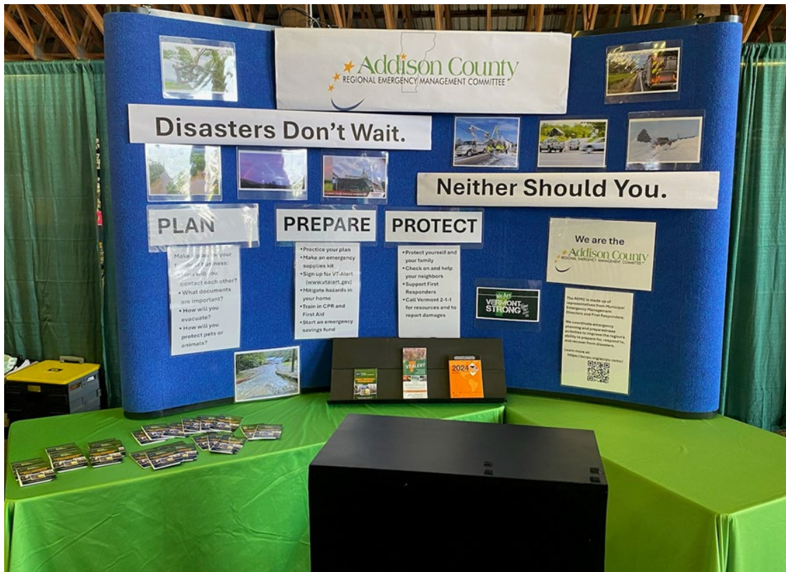
ACRPC booth at Addison County Field Days fair