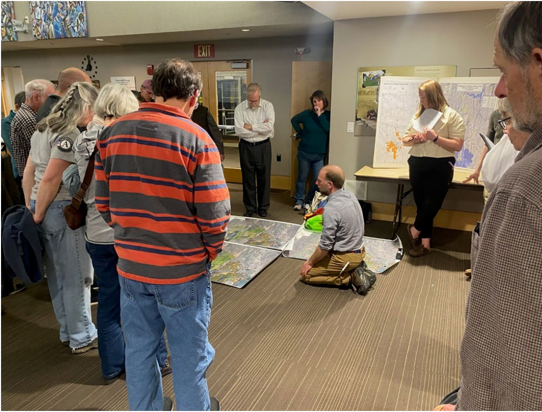
A mapping charrette at Middlebury College