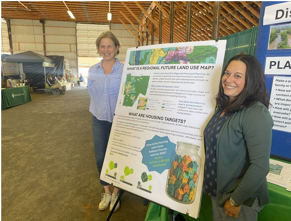
ACRPC staff promoting ACRPC's Future Land Use Map at the Fair