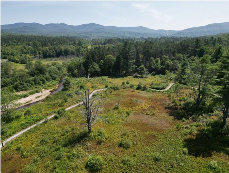
The Robert Frost Trail in the Moosalamoo NRA