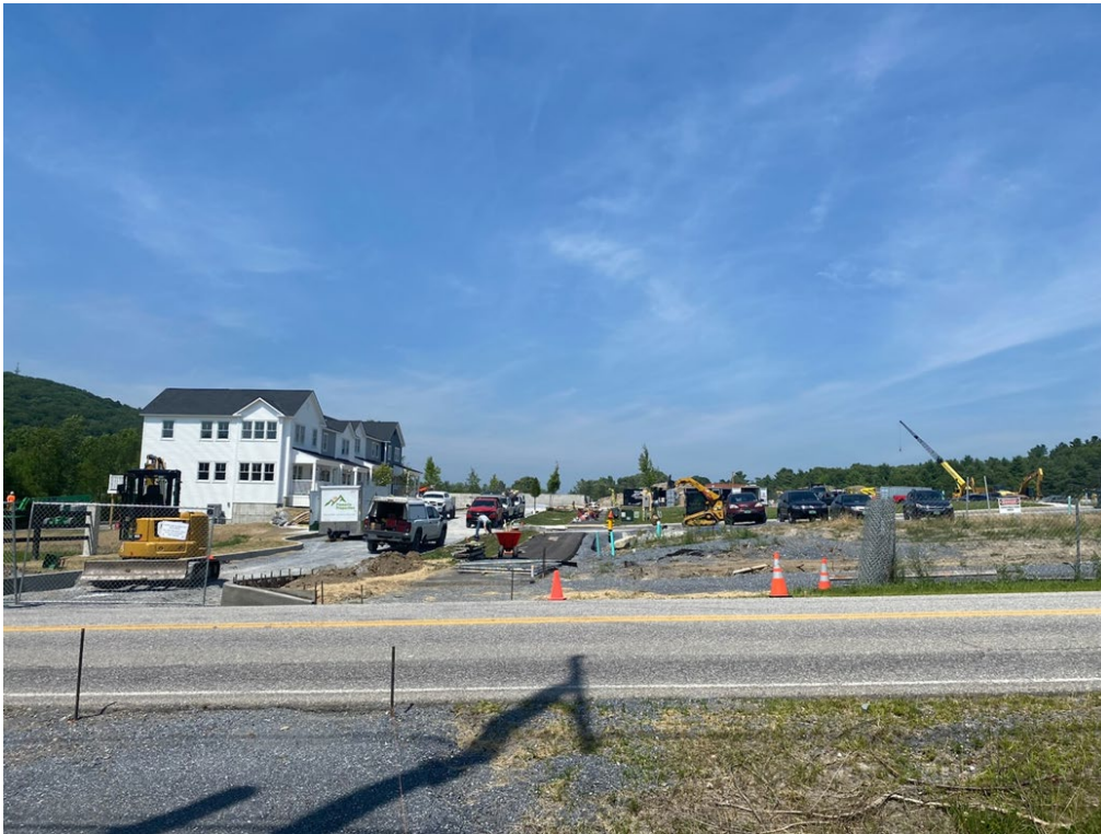
Stonecrop Housing development Middlebury