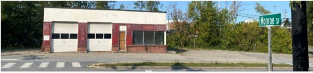
Former Maverick Gas station in Middlebury being redeveloped as new entrance to Middlebury High School