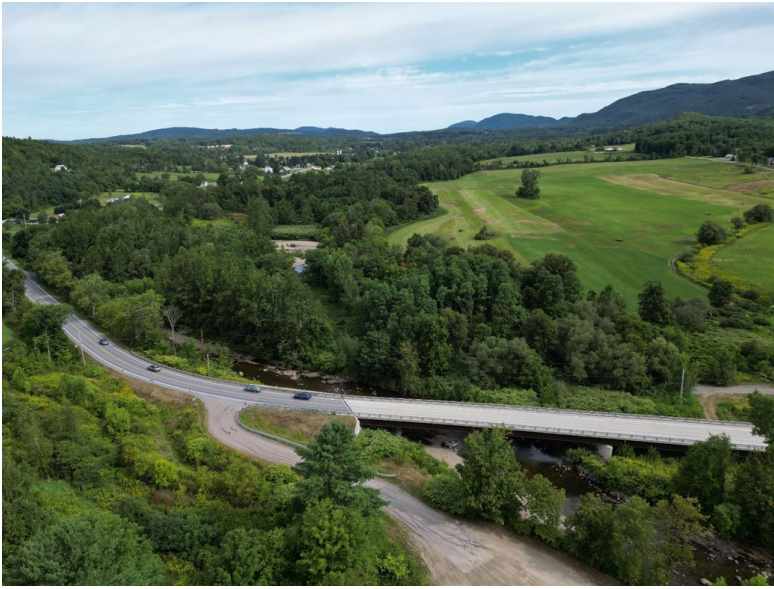
New Haven River and Route 116